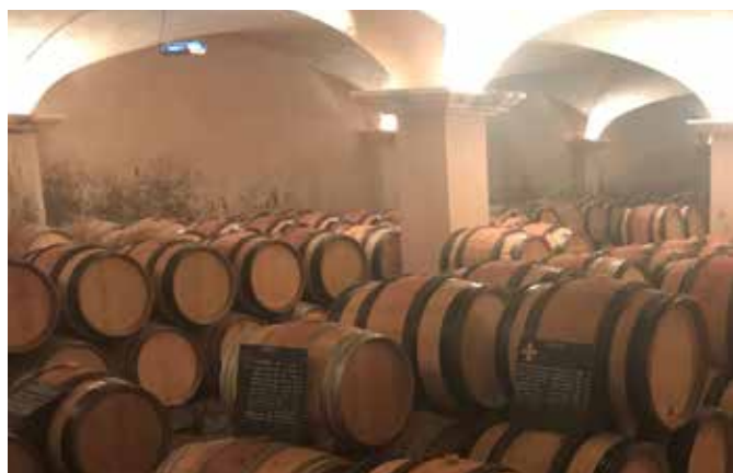
The Cellars at Domaine Mestrel-Michelot