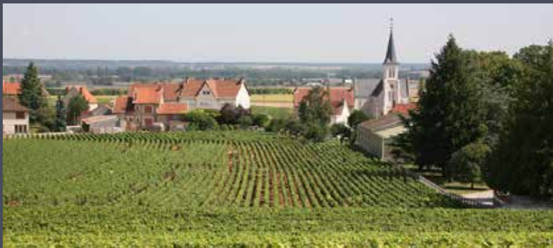
Côte de Nuits

However great Bourgogne Pinot Noir can be found, offering a style and quality far above its humble AOC labelling. Wines from top producers in famous villages are all available, albeit in smaller quantities, yet at remarkably attractive prices. These great domaines will often have a lower yield, more concentration, more typicity and a great degree of regional characteristics, as well as age worthiness and breeding. The name of the producer, however, is crucial to finding a decent bottle.