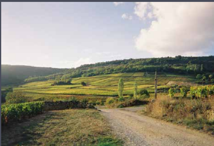
Denis Carré Vineyards

Of all the 42 Premier Cru, the most notable is Clos du Roi (The Royal wine). Named as it was so often favoured by the Kings of France in their day. It sits on a tiny strip of sand and clay deposits, which gives a degree more heat retention and ripening to the Pinot Noir, tasting almost precocious in its youth.