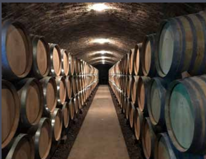
The Cellars at Domaine Tollot-Beaut

However great Bourgogne Pinot Noir can be found, offering a style and quality far above its humble AOC labelling. Wines from top producers in famous villages are all available, albeit in smaller quantities, yet at remarkably attractive prices. These great domaines will often have a lower yield, more concentration, more typicity and a great degree of regional characteristics, as well as age worthiness and breeding. The name of the producer, however, is crucial to finding a decent bottle.